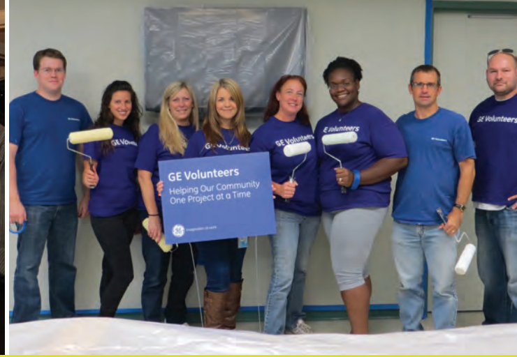
We extend our gratitude to GE, Northern Rivers Signature Sponsor. Through the APAF Walk for Education, Champions for Children Presenting Sponsorship, numerous volunteer projects including GE Earth Day, and individual employee giving and GE Foundation matching, GE's impact for more than 125 years is felt throughout the more than 40 counties we serve in upstate NY. Thank you to all of the members of the GE Family!